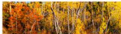
Gallery Day 9 Afternoon