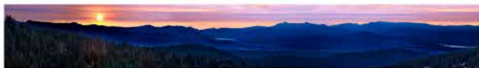
Equinox Day 9 Sunset