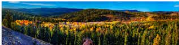
Spectrum Day 18 Sunset