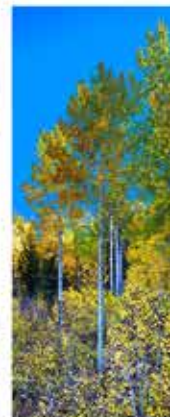
Elevation Day 12 Morning