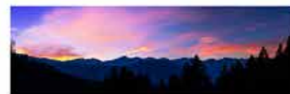
Chromatic Day 21 Twilight