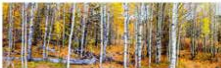
Diffusion Day 10 Afternoon