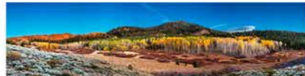
Connection Day 17 Evening