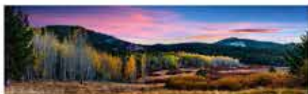
Symphony Day 19 Twilight