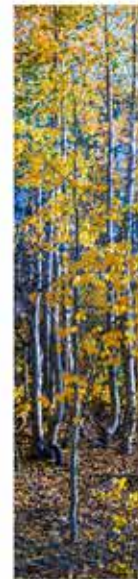
Aspiration Day 12 Afternoon