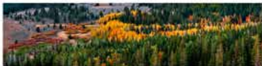
Transition Day 9 Afternoon